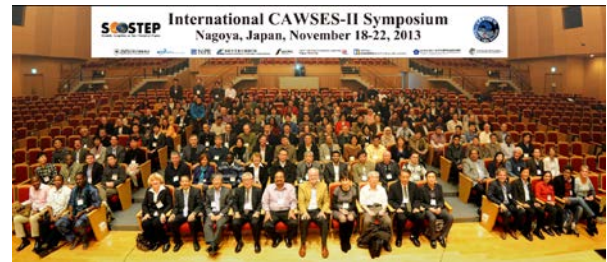
Photo 4: Group photo of the CAWSES II Symposium participants.