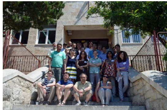
Photo 1: Group Photo of ISEST Workshop, June 17-20, 2013, Hvar, Croatia

This international workshop was attended by 27 people from 11 countries, including Austria, Belgium, China, Croatia, France, Germany, India, Iraq, Poland, Russia, and United States. In addition to the 27 participants on site, there were another 25 individuals signed up to participate in the program through online platform. The online platform was achieved through a WIKI website located at http://solar.gmu.edu/heliophysics/index.php/Main_Page (The meeting website is kept at http://spaceweather.gmu.edu/meetings/ISEST/ )