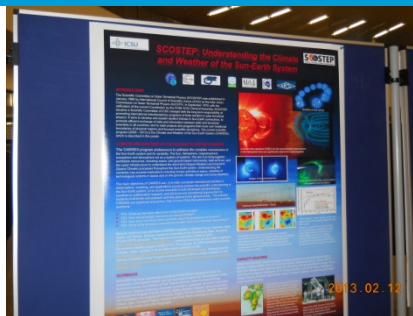
Photo 2: SCOSTEP's poster at the ILWS 10 th anniversary symposium

SCOSTEP also participated in the 10 th Anniversary Symposium of the International Living With a Star (ILWS) Program, ( http://ilwsonline.org/tenthanniversary/ ). All posters can be found on the SCOSTEP website.