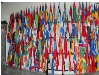
Photo 1: The flags of the countries participants in the ILWS Symposium

SCOSTEP's first participation in the work of the COPUOS as a Permanent Observer was in the 50 th session of the STSC (Scientific and Technical Subcommittee) held during February 11-15, 2013 in Vienna. SCOSTEP activities were featured by the display of 9 posters from SCOSTEP National adherent members, namely, Bulgaria, Canada, Germany, India, Japan, New Zealand, Norway, Russia, Slovakia, and USA. There was also a SCOSTEP poster highlighting current activities..