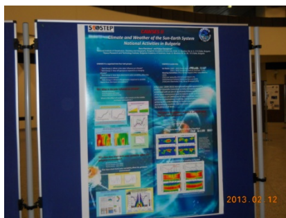
Photo 3: The poster featuring the SCOSTEP/CAWSES activities in Bulgaria