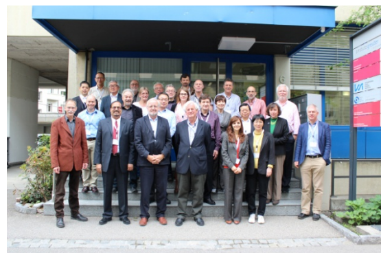
Photo 8: The participants in the ISSI/SCOSTEP Forum, Bern, May 7-8, 2013.

A Forum of 25 scientists was created to review the white papers submitted and make recommendations to the SCOSTEP Bureau for the new scientific program(s) to succeed CAUSES II. The Forum was organized and hosted by the International Space Science Institute (ISSI) in collaboration with SCOSTEP and met for a two-day discussion during May 7-8, 2013 at the ISSI headquarters in Bern, Switzerland.