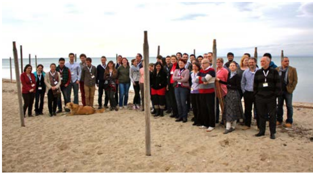
Photo 7: The participants in the COST/TOSCA Science School, Thessaloniki.

TOSCA is a pan-European action that brings together over 70 leading European scientists and aims at making progress on scientific understanding of the Sun-climate connection. This connection is a typical example wherein progress has been hampered by the lack of interaction between various scientific communities. For that reason, the multidisciplinary programme of this school addressed various aspects of the Sun-Earth system, emphasizing the need for a global view of the system.