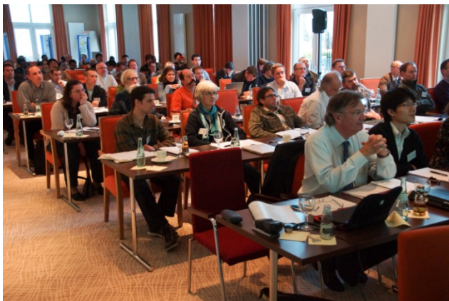
Figure 3: Participants in the MST 13 Workshop, held in Kühlungsborn, Germany on March 19 – 23, 2012.