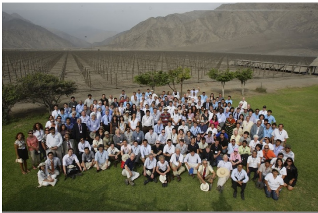
Figure 2: Group-photo of the participants in the ISEA13 and the celebration of the JRO 50 th anniversary.

The 13 th International Symposium on Equatorial Aeronomy (ISEA13) was held on March 12-16, 2012, in Paracas, Peru. ISEA meet every three to four years. The meeting is a major gathering of scientists around the world interested in the low-latitude atmosphere and ionosphere and their coupling to other latitudes and altitudes. Each ISEA meeting represents an opportunity for researchers to share their most recent results and discuss possibilities for future campaigns and experiments. The objective of the symposium is to bring together the leaders in the field of equatorial, low-latitude and mid-latitude aeronomy to advance our knowledge of these regions of the Earth's atmosphere. Topics for the workshops cover a wide range of research areas, reflecting the need to study the Earth's ionosphere/atmosphere system in a coupled sense.